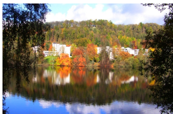
University of Stirling

God of all seasons, we thank you for Autumn.